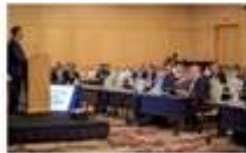
Toronto, Fall 2015