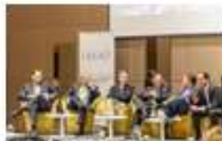
Bogota, Fall 2017