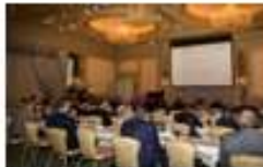
Tokyo, Fall 2014