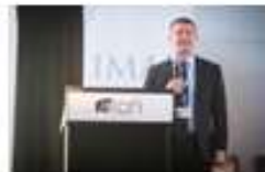
Boston, Fall 2016