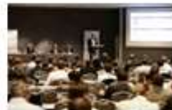
Rotterdam, Spring 2017