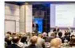
Milan, Spring 2016