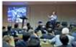
Dublin, Spring 2015