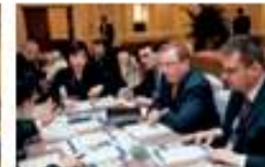
Barcelona, Spring 2014

Mumbai, Fall 2013 Chicago, Spring 2013 Ankara, Fall 2012 Beijing, Spring 2012